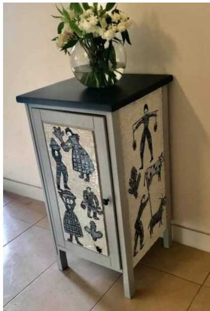
Susan Fajkind - Restored cabinet