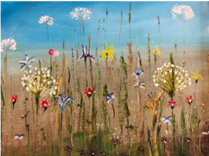
Merv Ritter – Field of Flowers