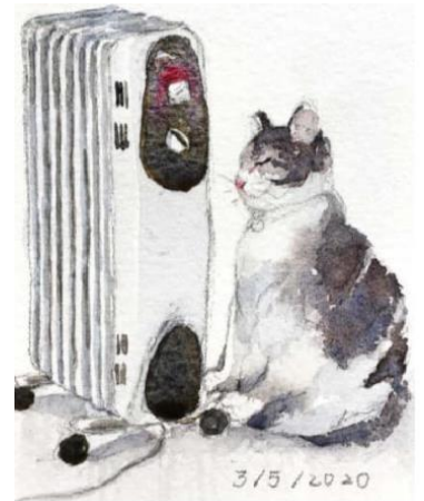
“Falling in Love” Qing Zhang. Watercolour – 9 x 14 cm

Titled Art in Isolation , it is open to members and non-members alike, inspiring them and providing a much needed impetus to continue creating art. It also provided an opportunity to exhibit the works online. These displays will continue as long as on location sessions are not possible.