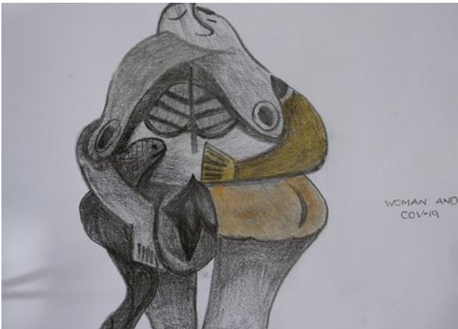
Doith Candy - Woman and Covid-19