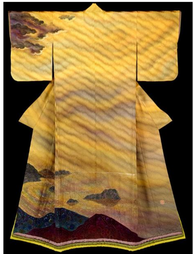
Fugen – 2004

Kubota would brush on natural traditional dyes and steam iron to fix the dye then remove the threads carefully. He would form head shaped lumps looped 3 times and then double knotted, dyed and hand coloured, to allow controlled colour blending. Steam fixing could take 40-90 minutes. Small scissors were used to remove the thread, using force proportional to the knot strength. Great care was needed to avoid damage to the finish of the kimono, and later additional work of embroidery, gilding or hand painting. Materials were ribbed, crumpled into Buddhist and Shinto patterns and forms.